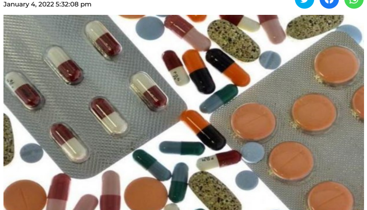
'Molflu is expected to be available from early next week in pharmacies throughout the country with particular focus on states with high caseload of COVID-19," the spokesperson noted

Dr Reddy's Laboratories on Tuesday said it will launch Molflu (Molnupiravir) at Rs 35 per capsule to treat COVID-19 in the country. Molflu will be priced at Rs 35 per capsule, a spokesperson of the Hyderabad-based drug maker said in a statement. With 10 capsules per strip, the total course of 40 capsules over 5 days would cost Rs 1,400, making it among the most affordable treatment options available to patients, it added.