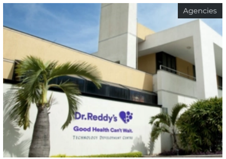
The Hyderabad-based firm said it will introduce the drug under the brand name Molflu in India.

The drug firm said it is able to manufacture the active pharmaceutical ingredient (API) as well as the formulation for Molnupiravir, and has made adequate capacity preparations to ensure that it is able to help patients in India as well as in patient populations in need around the world.